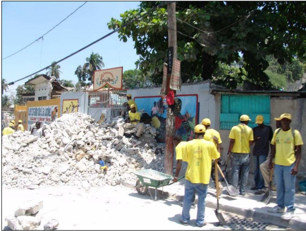
A government-funded work crew clears a pile of rubble by hand.

For some, July 12 th was just another Monday, but for those of us affected by the Haiti earthquake, this day marked the six-month anniversary of the disaster. In spite of the time that has passed, the memories remain vivid—the ground shaking beneath me, the cries of the injured, dust and fear clouding the air.