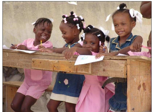
The money raised is enough to send all four of these girls to school for a year!